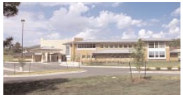
The ALSA Center Housed in the Landon Center 3599 Rainbow Blvd. Kansas City Kansas 66160.