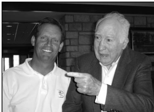
George Brett passed tournament honors to baseball great, Joe McGuff at a press conference at the Nicklaus Golf Club at Lion's Gate on January 30, 2003.